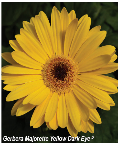
Gerbera Majorette Yellow Dark Eye D