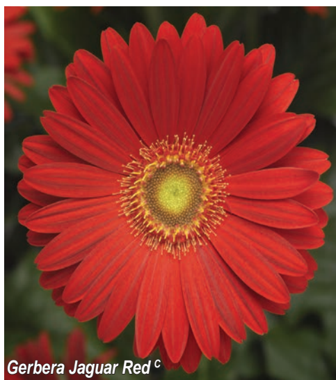
Gerbera Jaguar Red C