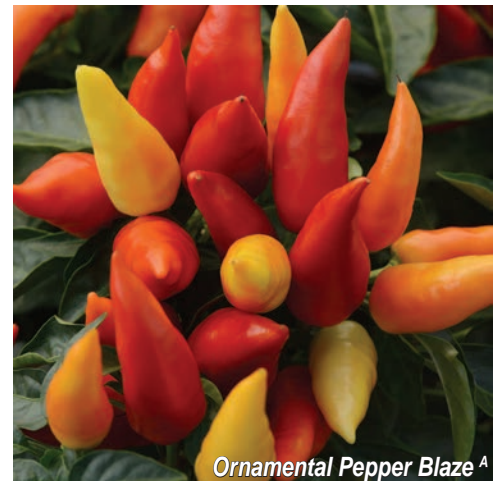
Ornamental Pepper Blaze A