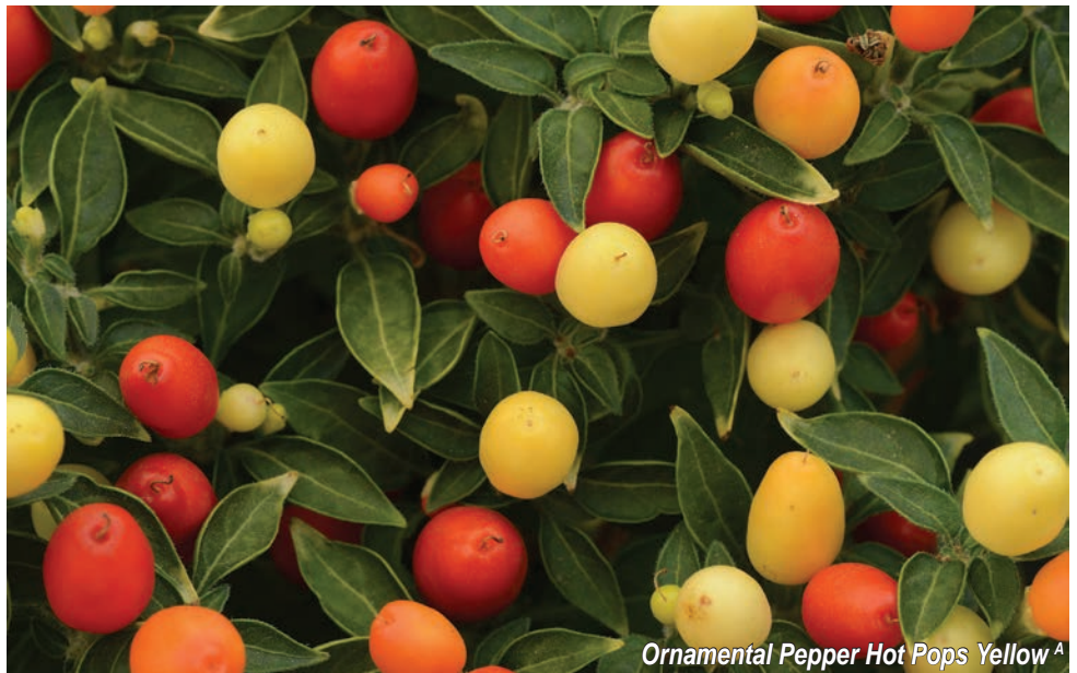
Ornamental Pepper Hot Pops Yellow A