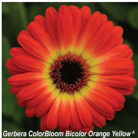
Gerbera ColorBloom Bicolor Orange Yellow A