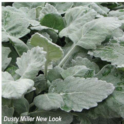
Dusty Miller New Look