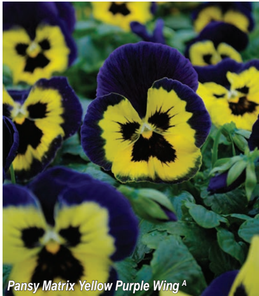
Pansy Matrix Yellow Purple Wing A