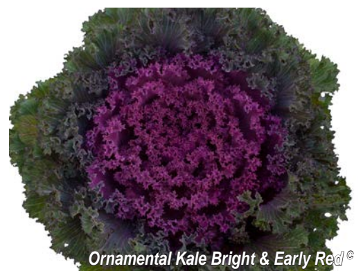
Ornamental Kale Bright & Early Red ®