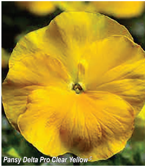
Pansy Delta Pro Clear Yellow ©