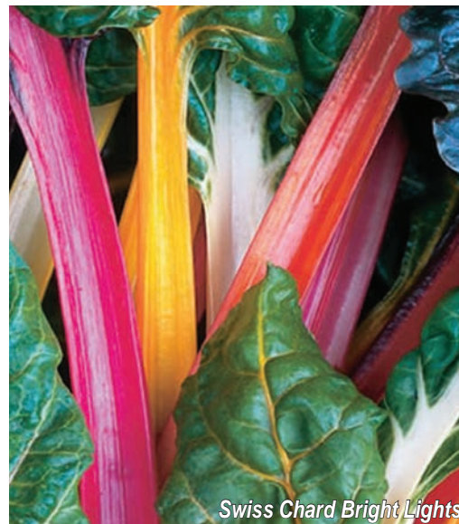
Swiss Chard Bright Lights

Autumn Select Mix Jump Up Mix Blue Blotch Deep Orange Neptune Purple Red True Blue White Yellow Yellow Blotch Yellow Burgundy Jump Up