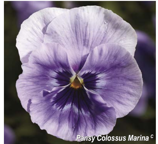
Pansy Colossus Marina ®