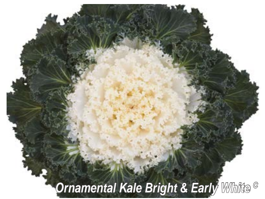
Ornamental Kale Bright & Early White ®