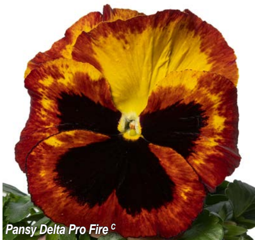
Pansy Delta Pro Fire ®