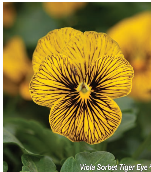
Viola Sorbet Tiger Eye A