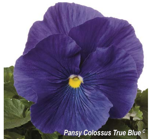
Pansy Colossus True Blue ®