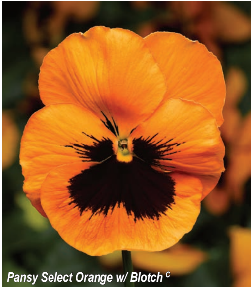
Pansy Select Orange w/ Blotch ©