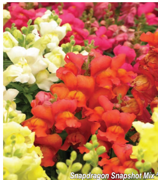
Snapdragon Snapshot Mix A