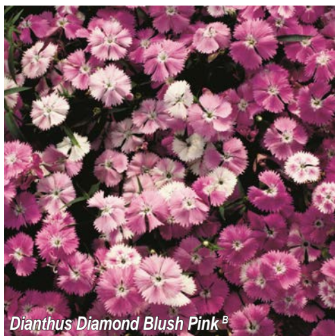
Dianthus Diamond Blush Pink ®