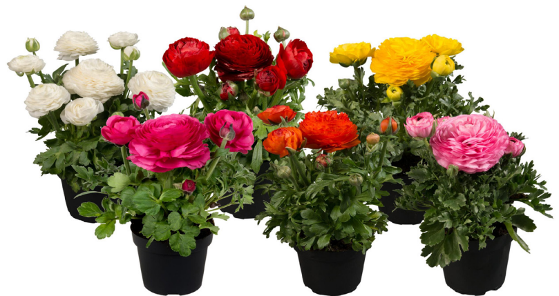
Ranunculus Sprinkles Dwarf Mix®

Sprinkles Dwarf is the genetically compact version of Sprinkles. Features a naturally round and compact habit with flowers that are short and close to the plant. Requires very little or no PGRs. Mix includes 6 colors: Dark Pink, Light Pink, Orange, Red, White and Yellow. Finish 4" pots from our 72s in 10-12 weeks. (72)