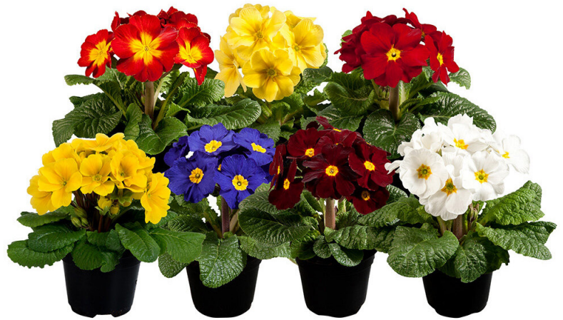
Primula Perola Mix®

Perola is a mid-late polyanthus-type primula with large blooms that sit atop strong stems above the foliage. Mix includes 7 colors: Blue, Cream Yellow, Red, White, Wine Red, Yellow and Yellow Red Bicolor. Finish 4" pots from our 72s in 10-14 weeks. (72)