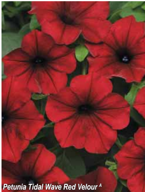
Petunia Tidal Wave Red Velour A