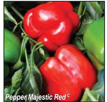
Pepper Majestic Red C