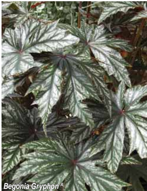
Begonia Gryphon A