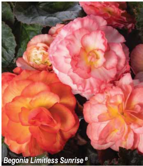
Begonia Limitless Sunrise B