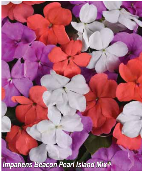
Impatiens Beacon Pearl Island Mix A