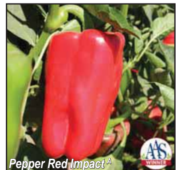
Pepper Red Impact A