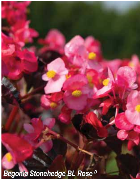
Begonia Stonehedge BL Rose D