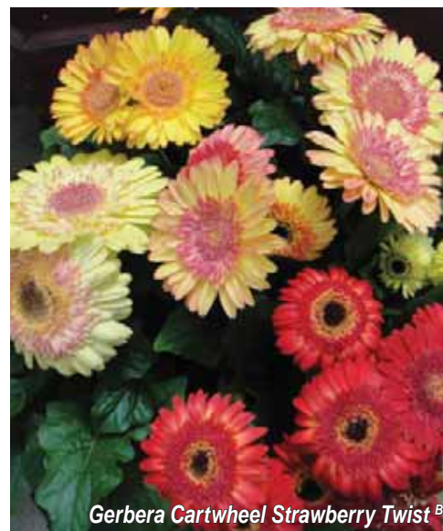
Gerbera Cartwheel Strawberry Twist B