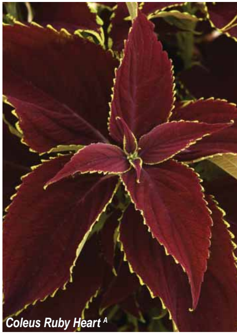
Coleus Ruby Heart A