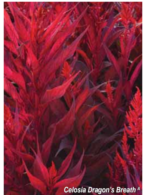
Celosia Dragon's Breath A