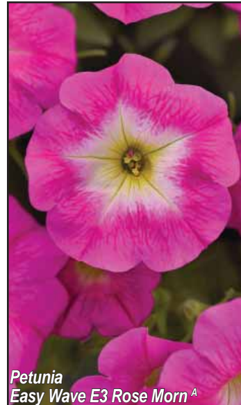
Petunia Easy Wave E3 Rose Morn A