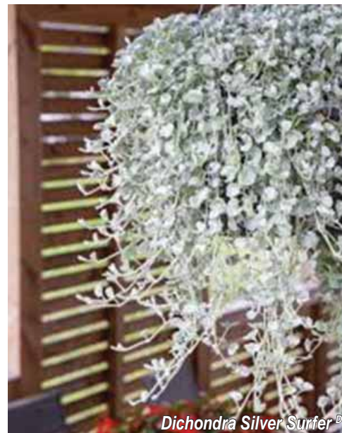
Dichondra Silver Surfer ®