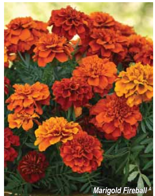
Marigold Fireball A