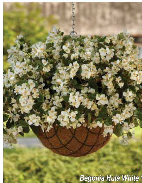
Begonia Hula White A