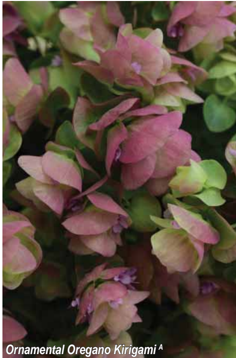
Ornamental Oregano Kirigami A