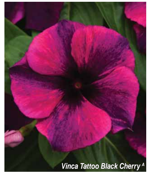
Vinca Tattoo Black Cherry A