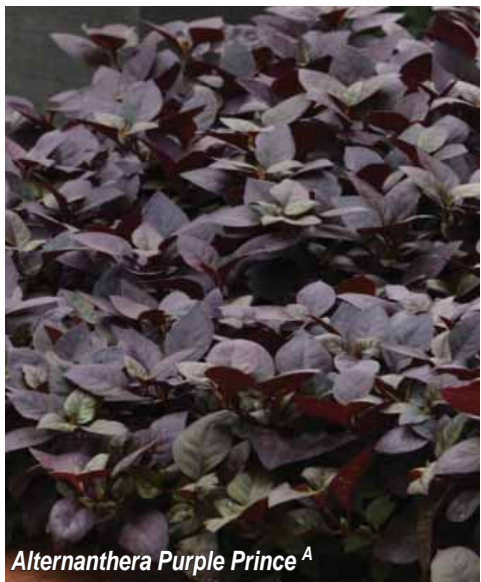
Alternanthera Purple Prince A