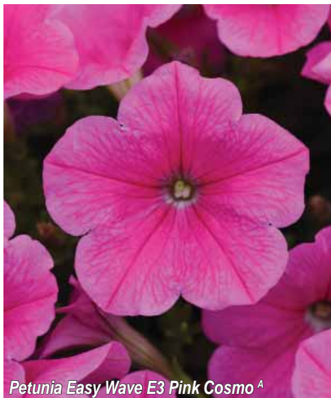
Petunia Easy Wave E3 Pink Cosmo A