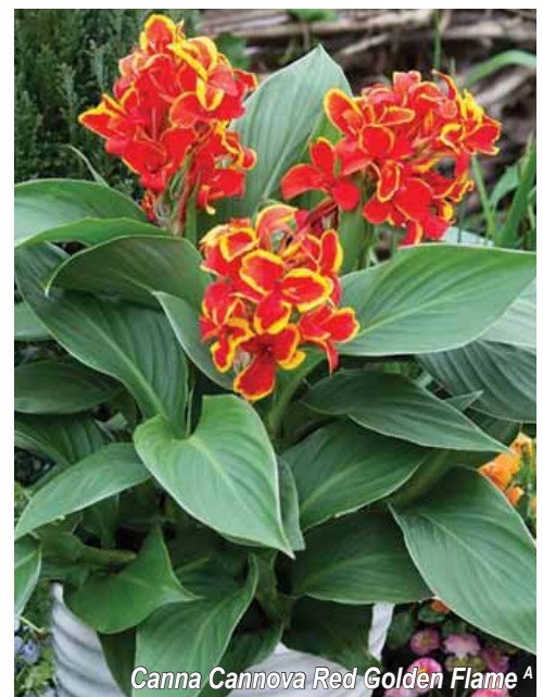
Canna Cannova Red Golden Flame A