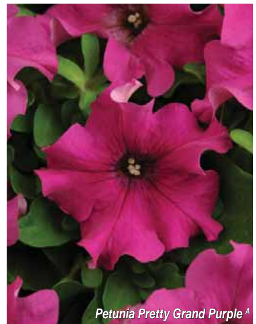
Petunia Pretty Grand Purple A