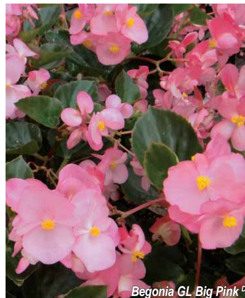
Begonia GL Big Pink D