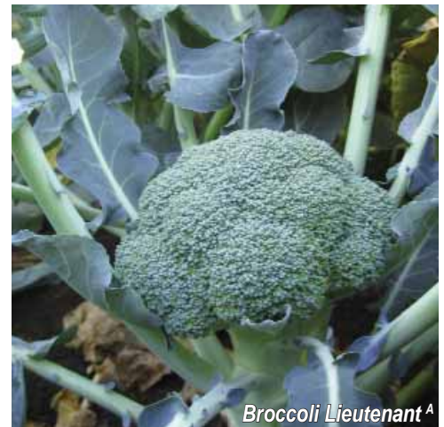
Broccoli Lieutenant A