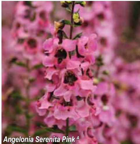
Angelonia Serenita Pink A