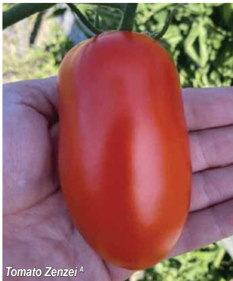
Tomato Zenzei A