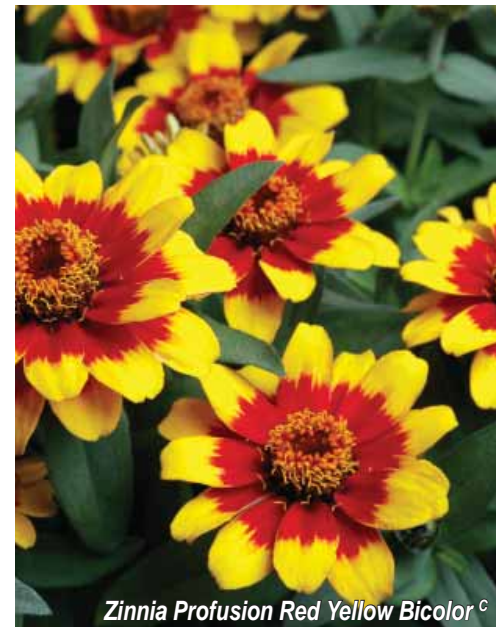
Zinnia Profusion Red Yellow Bicolor C