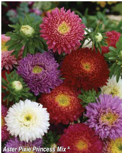
Aster Pixie Princess Mix A