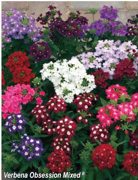
Verbena Obsession Mixed B