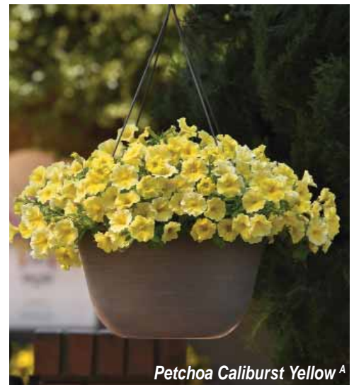
Petchoa Caliburst Yellow A