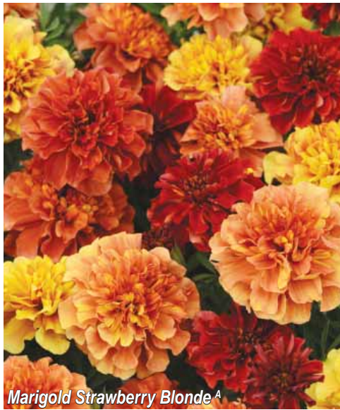
Marigold Strawberry Blonde A