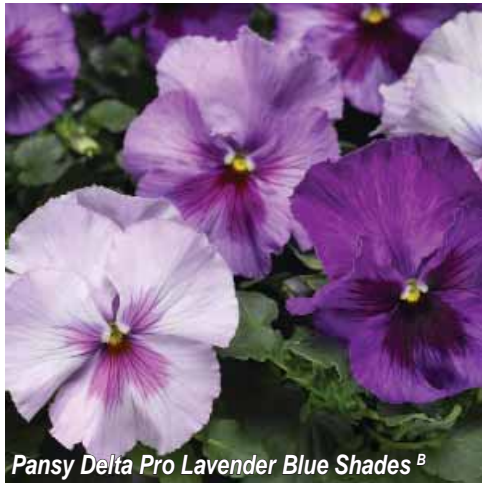
Pansy Delta Pro Lavender Blue Shades B