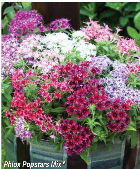
Phlox Popstars Mix B