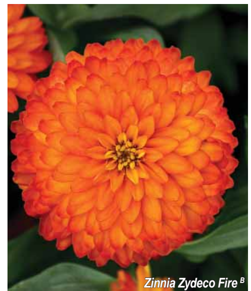
Zinnia Zydeco Fire B