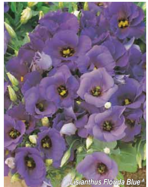
Lisianthus Florida Blue A

•512•288• Mixed Flame Gold Orange Spry Yellow