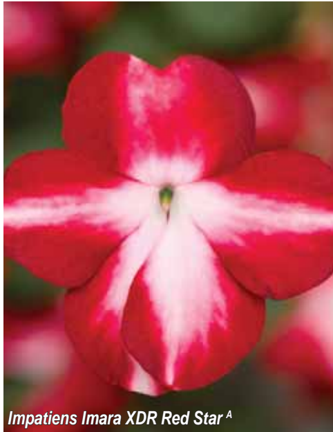
Impatiens Imara XDR Red Star A