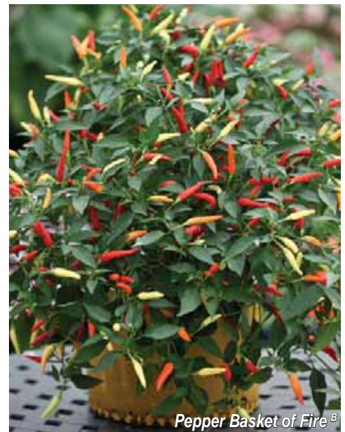
Pepper Basket of Fire B