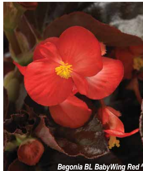
Begonia BL BabyWing Red A

Blush Pink Red Red White Bicolor White - NEW