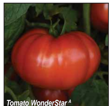
Tomato WonderStar A