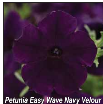
Petunia Easy Wave Navy Velour A