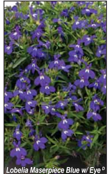
Lobelia Maserpiece Blue w/ Eye D