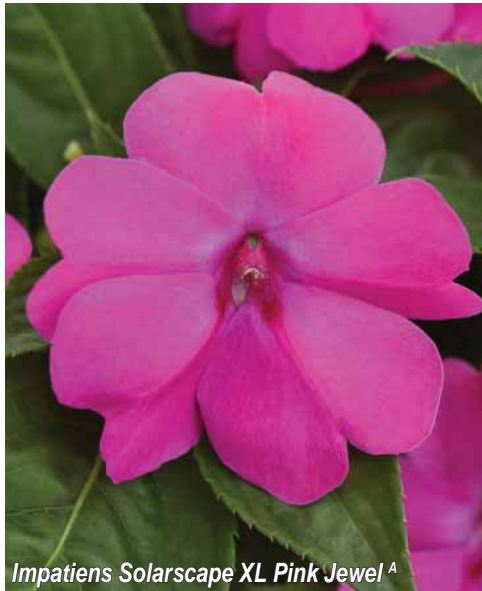
Impatiens Solarscape XL Pink Jewel A