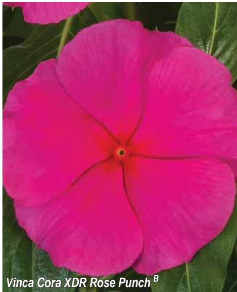
Vinca Cora XDR Rose Punch B