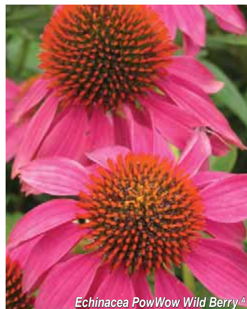
Echinacea PowWow Wild Berry A