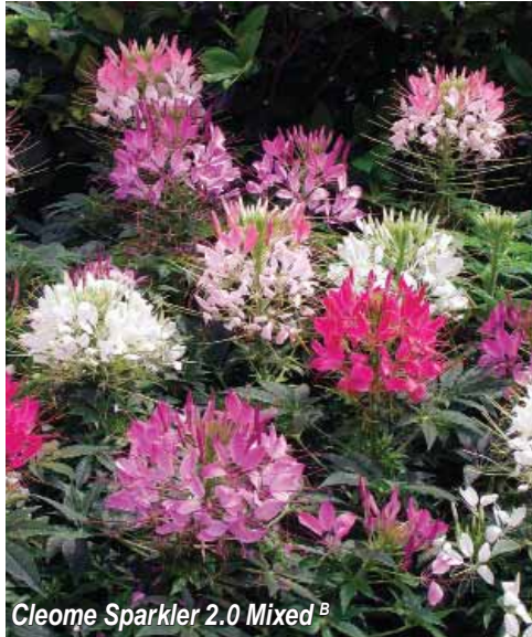
Cleome Sparkler 2.0 Mixed B