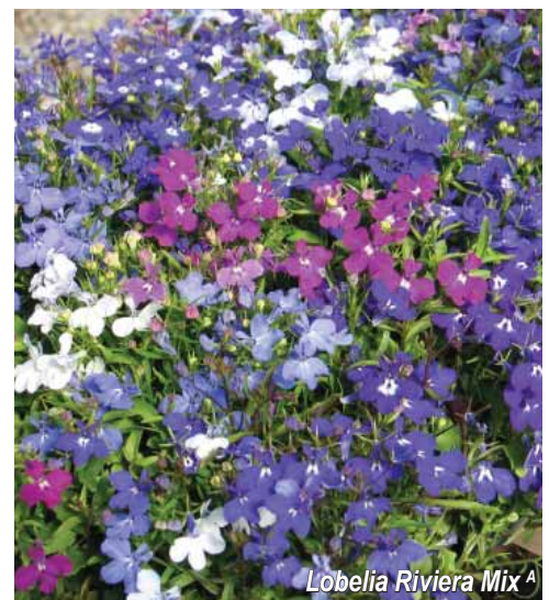
Lobelia Riviera Mix A