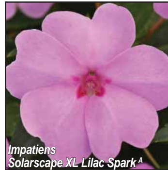
Impatiens Solarscape XL Lilac Spark A

Firebird is a determinate slicer tomato that produces extra-large, high-quality, globed-shaped 4.5-6.5 oz fruit. Matures in 75 days. (288, 51 Strip) WonderStar is a determinate early-maturing, bright red beefsteak tomato with excellent flavor producing 8-10 oz fruit. Matures in 60-65 days. (51 Strip) Zenzei is a very vigorous roma tomato plant that provides season-long harvesting. Indeterminate variety that produces 6-6.5 oz fruit. Matures in 70-80 days. (288, 51 Strip) Zenzei pictured on page 18.