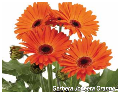
Gerbera Joybera Orange E