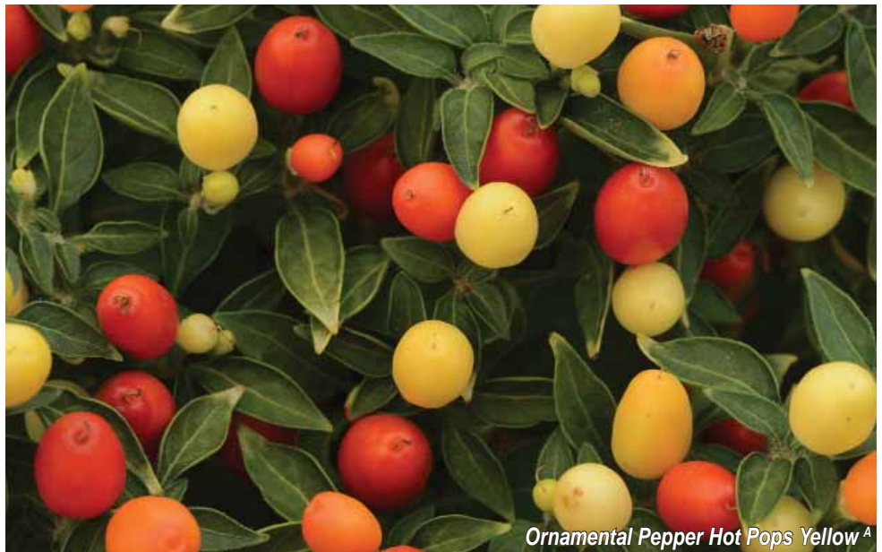
Ornamental Pepper Hot Pops Yellow A