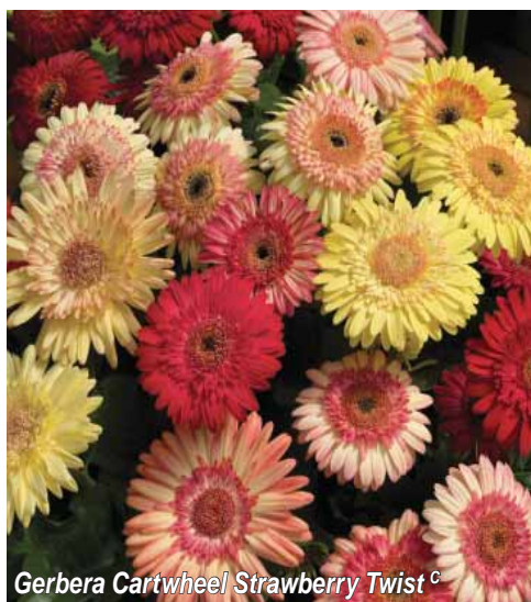
Gerbera Cartwheel Strawberry Twist C