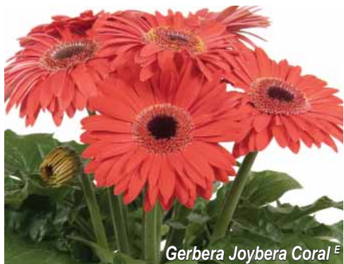
Gerbera Joybera Coral E