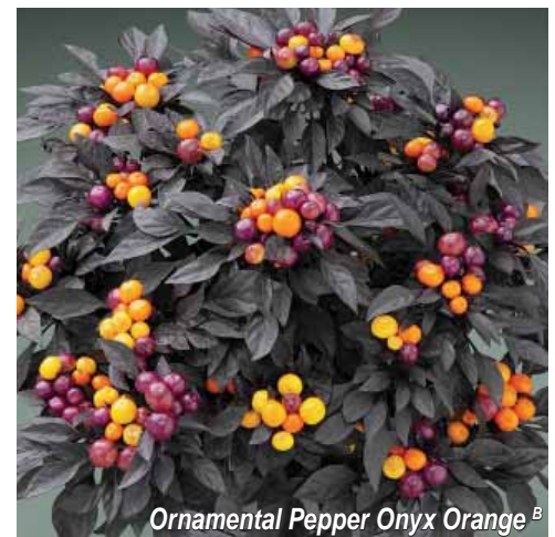
Ornamental Pepper Onyx Orange B