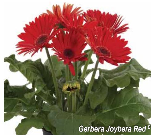
Gerbera Joybera Red E