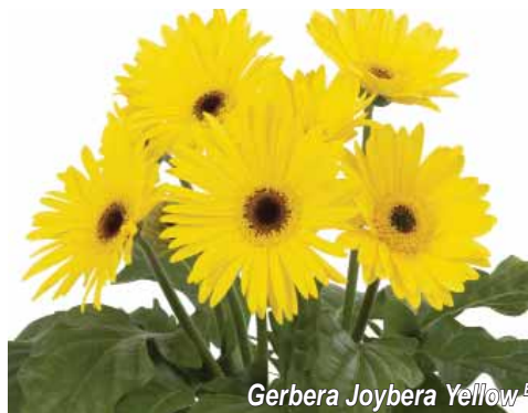
Gerbera Joybera Yellow E