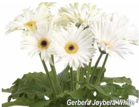
Gerbera Joybera White E