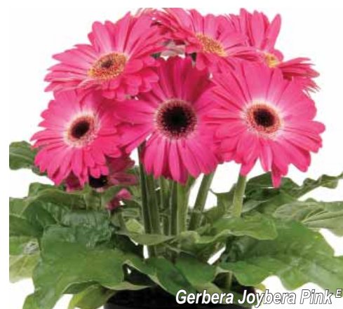
Gerbera Joybera Pink E

The Acapulco XP series offers compact plants with excellent uniformity and no PGRs needed. Nice in 4" pots. Finish in 4" pots from our 51 strip in about 10 weeks. (51 Strip) Multicolor Red pictured on previous page. Multicolor Orange pictured on page 3.