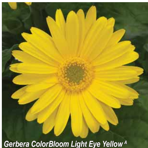
Gerbera ColorBloom Light Eye Yellow A