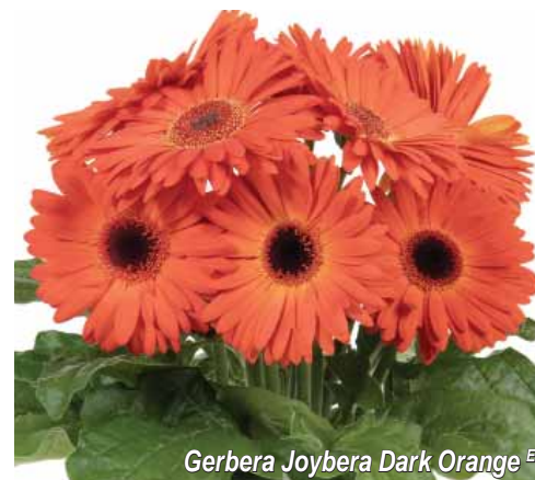
Gerbera Joybera Dark Orange E