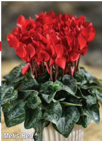
Metis Red A