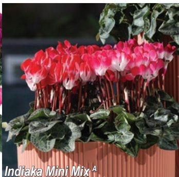
Indiaka Mini Mix A