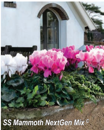
SS Mammoth NextGen Mix C