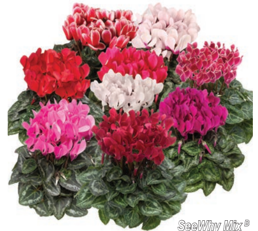
SeeWhy Mix ®