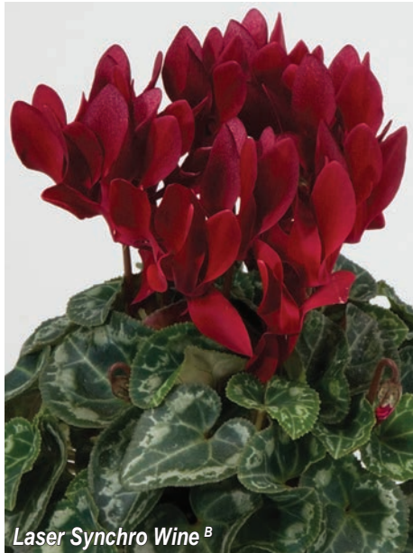
Laser Synchro Wine ®