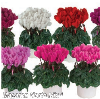
Macaron North Mix A