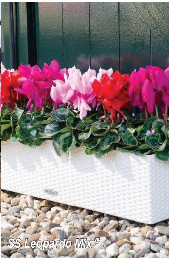
SS Leopardo Mix C