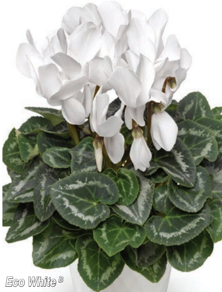
Eco White ®