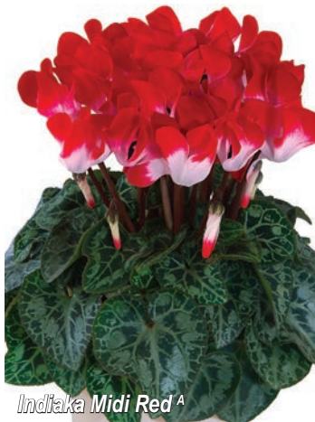
Indiaka Midi Red A