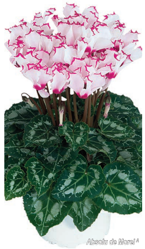
Absolu de Morel ®