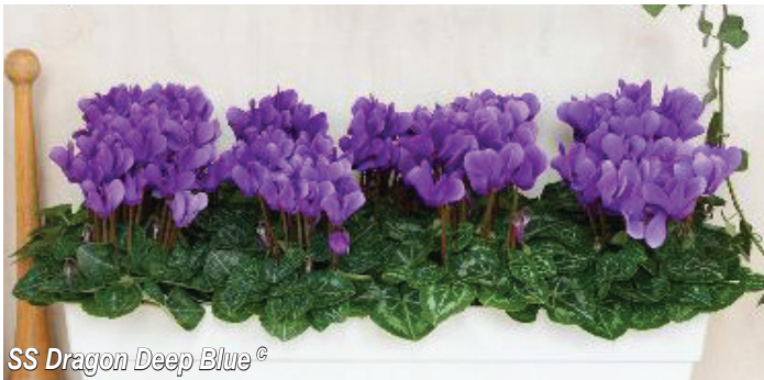
SS Dragon Deep Blue C