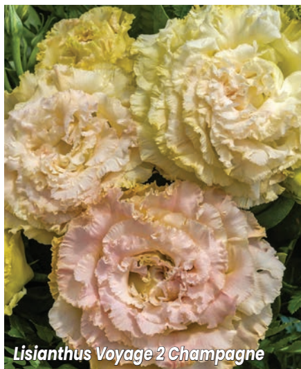
Lisianthus Voyage 2 Champagne