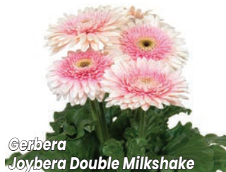
Gerbera Joybera Double Milkshake