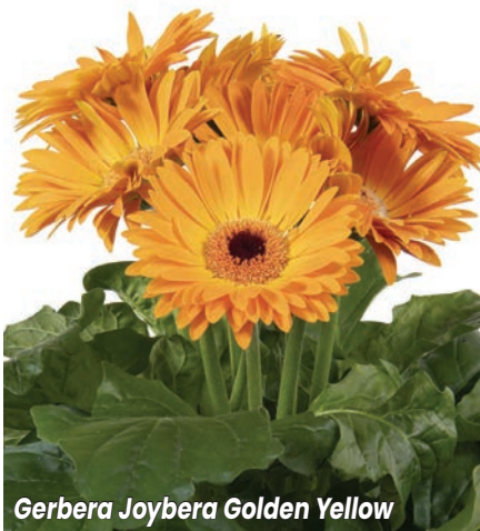
Gerbera Joybera Golden Yellow

Mix Bicolor Orange Yellow Bicolor Red White Dark Eye Deep Orange Dark Eye Red Dark Eye Watermelon Dark Eye White Dark Eye Yellow Light Eye Cherry Light Eye Deep Rose Light Eye Red Light Eye Yellow