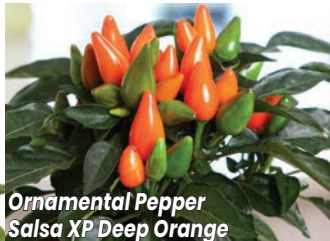
Ornamental Pepper Salsa XP Deep Orange