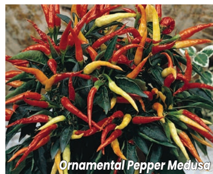
Ornamental Pepper Medusa