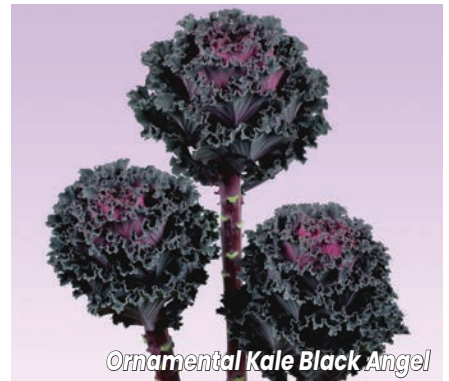
Ornamental Kale Black Angel