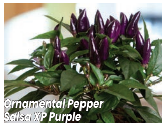
Ornamental Pepper Salsa XP Purple