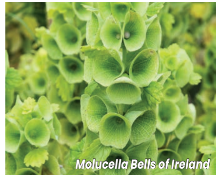
Molucella Bells of Ireland

Height: 24-30" Bright semi-double 3-4" flowers •144•51 Strip•