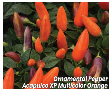
Ornamental Pepper Acapulco XP Multicolor Orange