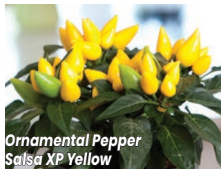
Ornamental Pepper Salsa XP Yellow