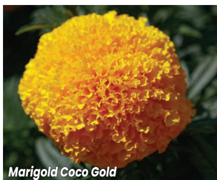
Marigold Coco Gold