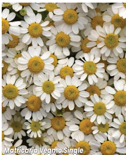
Matricaria Vegmo Single