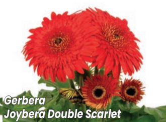
Gerbera Joybera Double Scarlet