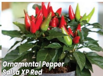
Ornamental Pepper Salsa XP Red