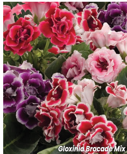
Gloxinia Brocade Mix