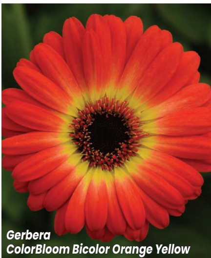
Gerbera ColorBloom Bicolor Orange Yellow