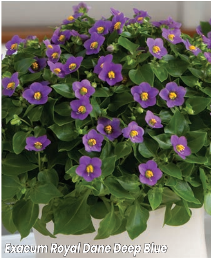
Exacum Royal Dane Deep Blue