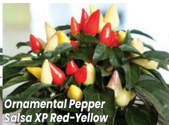
Ornamental Pepper Salsa XP Red-Yellow