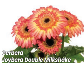
Gerbera Joybera Double Milkshake