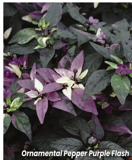
Ornamental Pepper Purple Flash