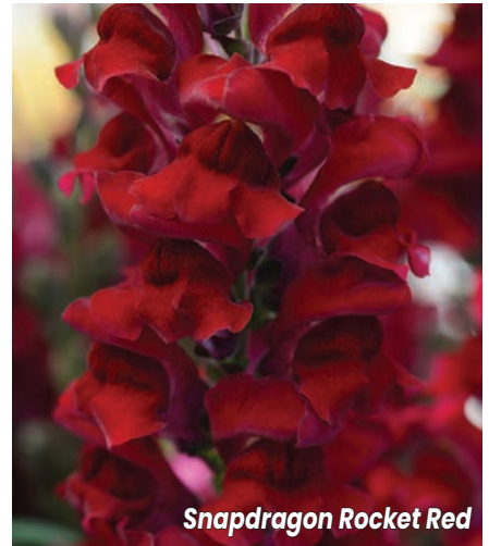
Snapdragon Rocket Red