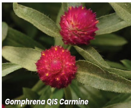
Gomphrena QIS Carmine