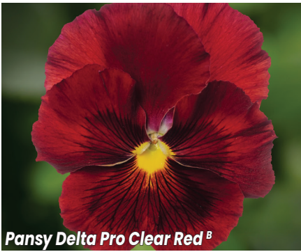
Pansy Delta Pro Clear Red B