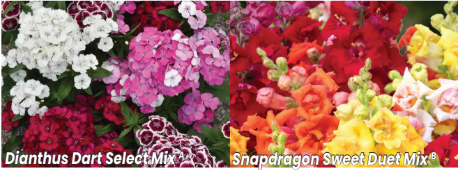
Dianthus Dart Select Mix A