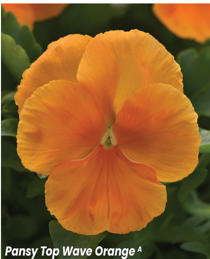
Pansy Top Wave Orange A