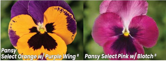
Pansy Select Orange w/ Purple Wing B

A special collection of large flowered pansies with unique, novelty colors. Can be used as add-ons to Delta Pro series. Garden height: 4-6". Finish pots in about 5 weeks from our 288s. (288, 384)