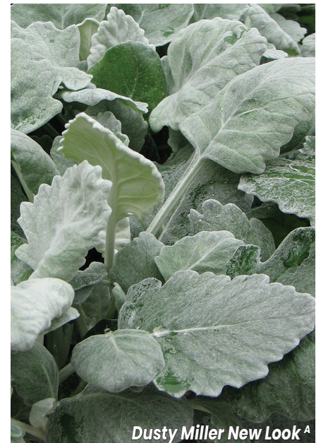
Dusty Miller New Look A