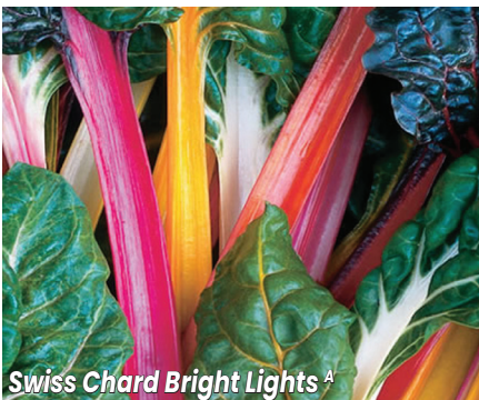
Swiss Chard Bright Lights A