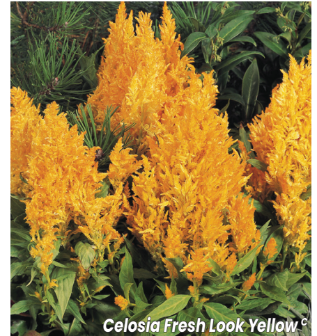
Celosia Fresh Look Yellow ©

Use: pots Ht: 6-8" Wavy-leaved compact cabbage •144•288•384• Pink Bicolor Red White