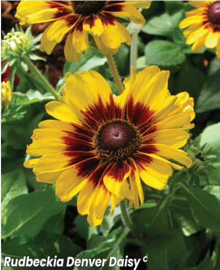
Rudbeckia Denver Daisy C