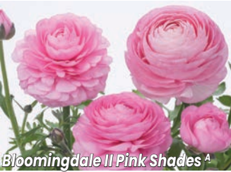
Bloomingdale II Pink Shades A