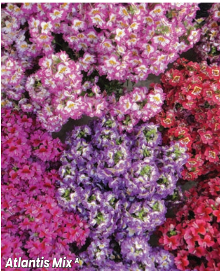
Atlantis Mix A