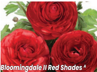
Bloomingdale II Red Shades A

Bloomingdale II offers a compact habit with early and uniform flowering. Ideal for quarts and 4" pots. Finish pots from our 72s in 10-12 weeks. (72 Tray) Rose Shades also pictured on front cover.