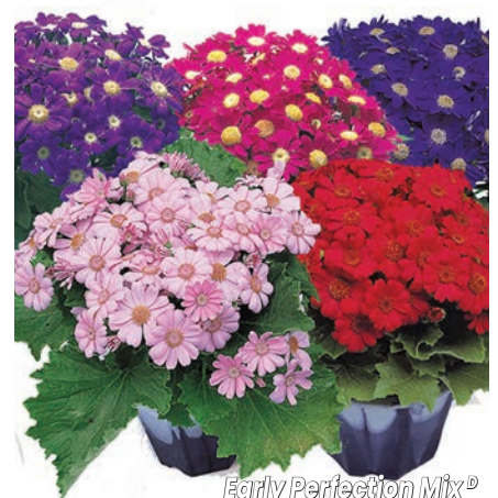
Early Perfection Mix D