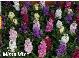
Mime Mix A