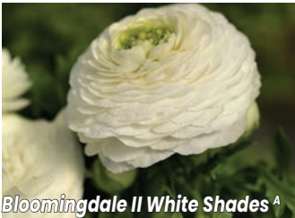
Bloomingdale II White Shades A

Mime Mix is a highly fragrant, extra-early flowering variety. Can also be used in garden borders and as a cut flower. Features uniform growth, strong upright stems and a high proportion of fully-double blooms. Ideal for 4" pots. Finish pots from our 51 strip in 6-8 weeks. (51 Strip)