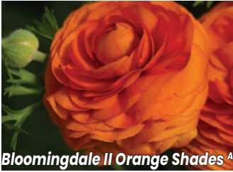
Bloomingdale II Orange Shades A

The Paradiso series features compact and uniform plants in a wide range of colors and timing. Minimal use of PGRs needed. Perfect for 4" pots. Finish pots from our 72s in 12-14 weeks. (72 Tray) Early Mix pictured on back cover.