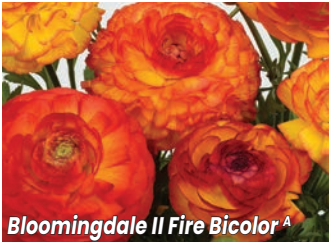
Bloomingdale II Fire Bicolor A