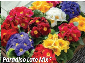
Paradiso Late Mix C