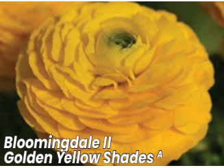
Bloomingdale II Golden Yellow Shades A