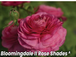
Bloomingdale II Rose Shades A