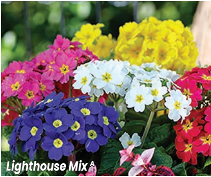
Lighthouse Mix A