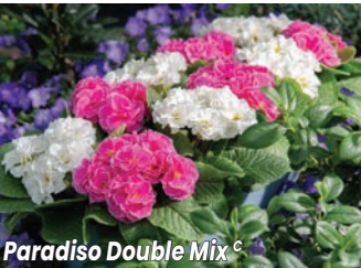
Paradiso Double Mix C