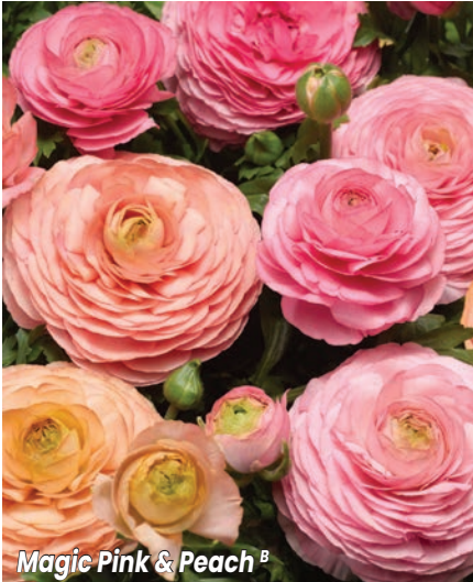
Magic Pink & Peach B

Use: 4" pots Available July 27 - Feb 5 Uniform habit, early •72•